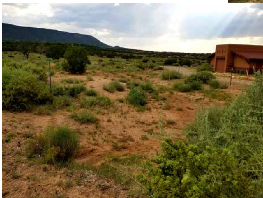
Photos of the area that was partially cleared by volunteers during the HOA –2017.