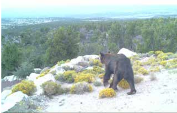
Black bear (loves to come during the day too).